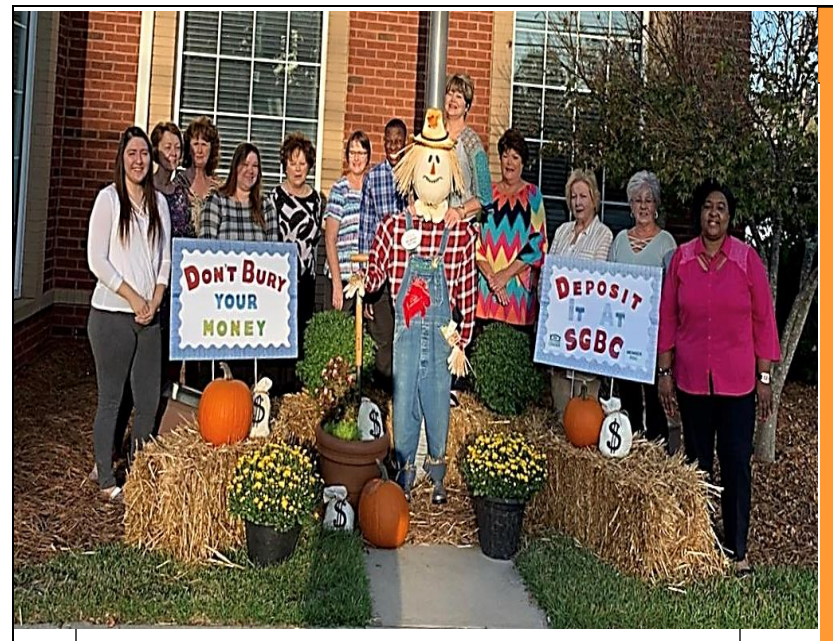
South Georgia Banking Company